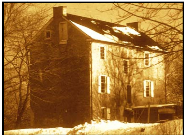
Nitre Hall 1935

The Holiday House Tour 2015 will be December 6, so mark your calendars!