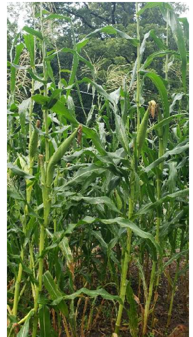
Heritage corn in the vegetable garden

The gardeners group always needs additional hands. You don't need to be a Master Gardener or do any heavy lifting, but should enjoy working outdoors. Also, contributions of native plants are appreciated. Contact Lois Puglionesi at loisp11@verizon.net