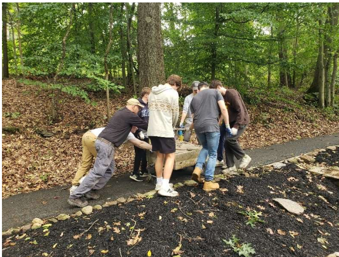
Villanova University Students move the large stone relief from Lynnewood Elementary School

Thanks to a group of student volunteers from Villanova University, who came to help with gardening on the national collegiate volunteer day, the heavy and unwieldy stone carvings from Lynnewood School that had been propped against the wall near the Nitre Hall entrance were moved to locations along the path that leads to the bridge into Nitre Hall's second floor. In this spot, they are more visible and contribute to understanding of the history of Haverford Township. Many of these Villanova students are in Villanova's engineering program so they were able to use their knowledge to find practical solutions for moving these items.