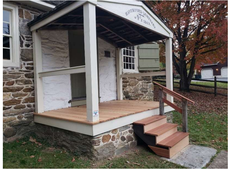
Federal School with new steps

This spring, Haverford Township School District's fourth graders will be engaged in a full-day, activity filled program at the Federal School. Begun in 1972, this adventure brings a fourth grade class into the Federal School as imaginary students in 1849. Under the direction of costumed teachers, the children practice writing with period ink and pens, create their own books, learn the names (in chronological order) of the American presidents, complete arithmetic assignments, use period toys during recess times, and read from the McGuffey Reader. As students engage in these activities, they are asked to compare their experiences as students with the expectations for students in the mid-1800s, as well as the consequences for not following these rules.