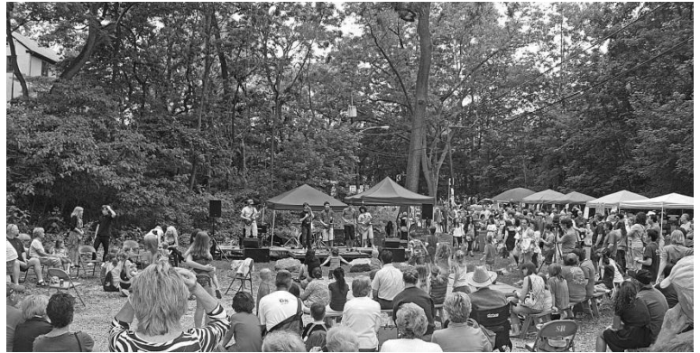
DGD plays to a huge crowd at the 2011 Heritage Festival.

Send your comments, suggestions and feature ideas for this newsletter to us at info@haverfordhistoricalsociety.org .